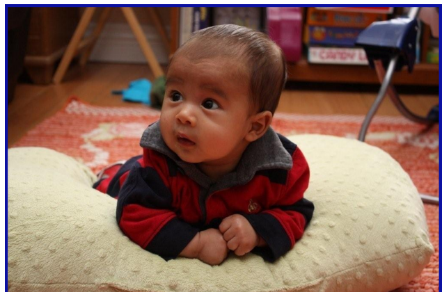
Tummy time on flat and inclined surfaces